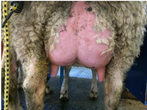
1733 as a yearling in May 2018